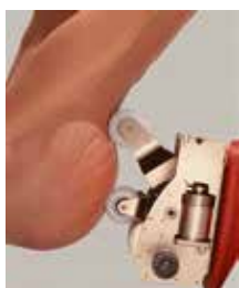
Lower The Movement