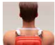
106mm Stride Adjustment