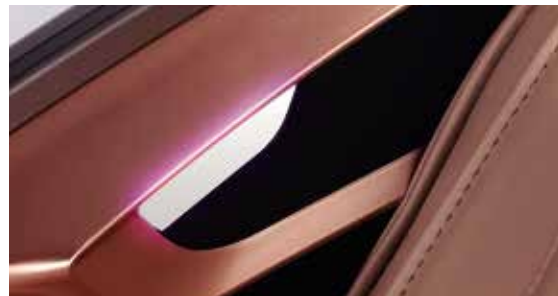
7-Color dynamic ambient lights Accompanied by the rhythm of the massage