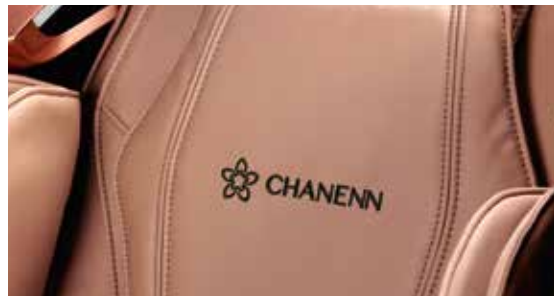
6-Sided cushion pillow Use it according to your personal force condition