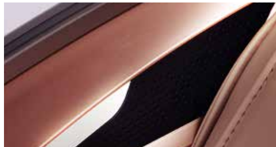
Hifi-level surround sound Bluetooth connection, built-in music library