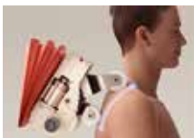
80mm Horizontal Range