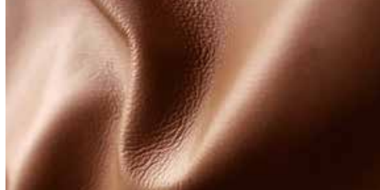
Comfortable and wear-resistant leather Skin-friendly, breathable, dirt-resistant