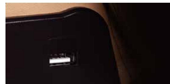
Embedded USB interface The mobile phone on the chair is out of power