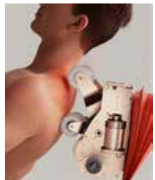
Upper The Movement