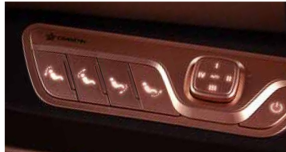
Armrest quick button Convenient To Operate