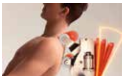
7 - Level Force Adjustment