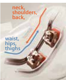
Waist - Spine Speed Massage