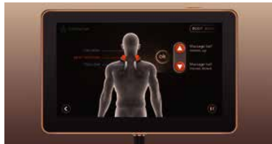
7-inch LCD touch screen The massage status is displayed in real time